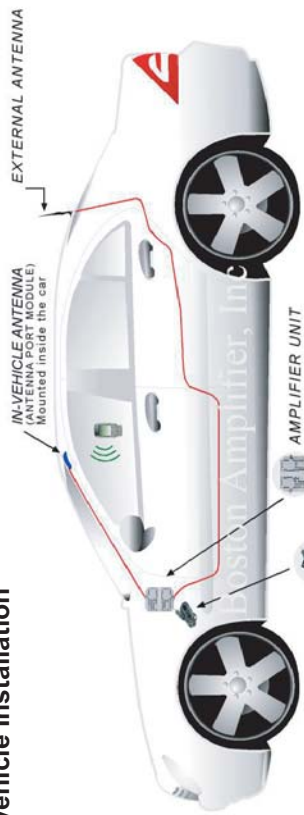
Figure 2 Copyright© 2002-Present Installed Wireless Dash Mount