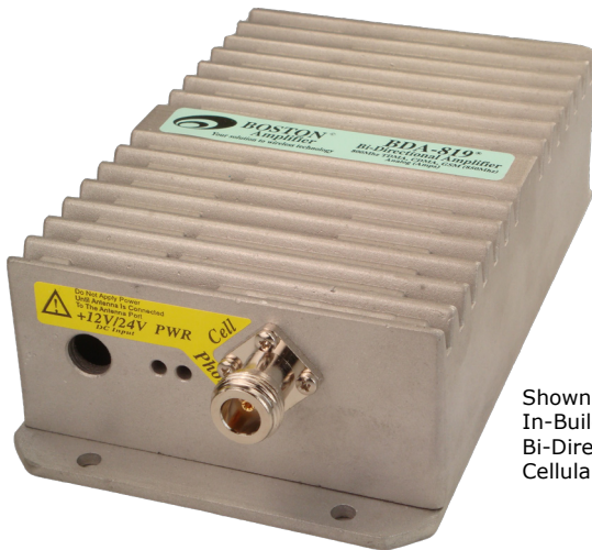
Shown Here: In-Building 65 dB Bi-Directional Cellular Amplifier

Cellular Coverage Made Simple for Vehicles, Homes, and Offices.