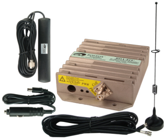
In-Vehicle Amplifier Kit

Do your customers complain about dropped calls or not being able to receive an important call? Now you can profit from these complaints and help your customers solve these problems with cellular amplifiers. What this means for your business, is new revenue and excellent profit margins .