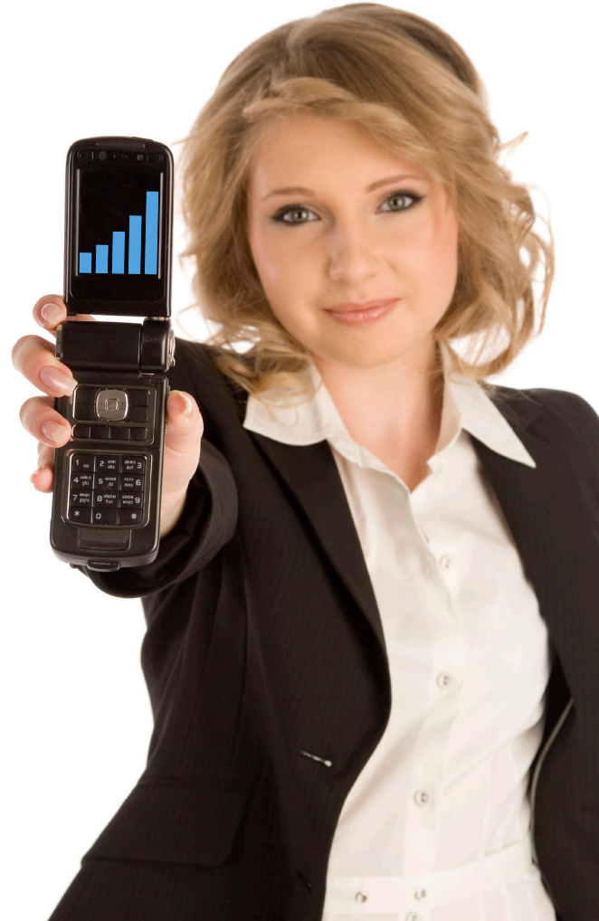
(Actual results may vary)