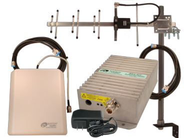
In-Building Amplifier Kit

Our product line includes: in-vehicle and in-building cellular bi-directional amplifiers (BDA's) and amplifier kits.